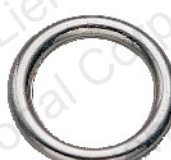
9Z Wire Dia.: 1.5, 1.8, 3.1mm Size: 5/16", 1/2", 5/8"