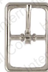
121KZ (Heavy Type)