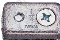
7316Z Wire Rope Clip Size: 1/8", 3/16", 1/4"