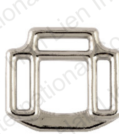
370ZH (Heavy Type)