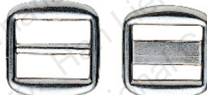
S210Z S510Z Size: 3/8", 1/2", 5/8", 3/4", 1"