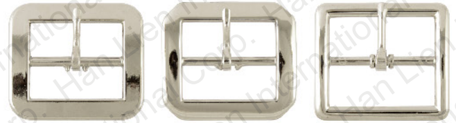
8531ZR (Round Corner)