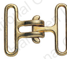
1375Z Clasp Size: 1 1/2"