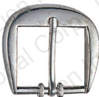
1567Z Size: 1 1/2"