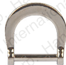
N3250Z (Heavy D Ring)