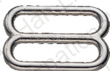
2300Z Size: 3/8", 1/2", 5/8", 3/4", 1", 1 1/2", 2"