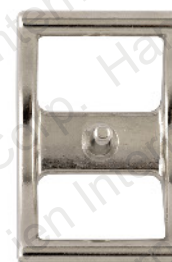
210ZH (Heavy Type)