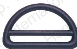
D112Z Size: 1 1/2"