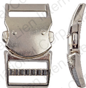
MK148Z Side Release Buckle Zinc Diecast O.L.: 1 7/8", 2 1/8", 2 5/16" Size: 5/8", 3/4", 1"