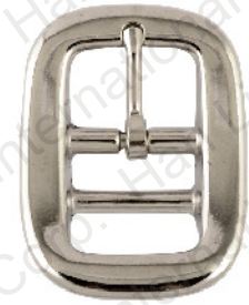
5705ZH (Heavy Type)