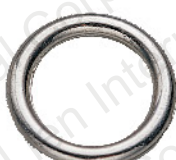
7Z Wire Dia.: 3.0, 3.0, 4.3mm Size: 3/8", 1/2", 5/8" Wire Dia.: 4.3, 4.3mm Size: 3/4", 1"