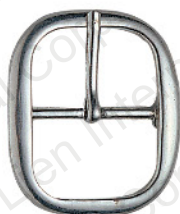
1566Z Size: 1 1/4", 1 1/2"