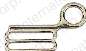
2008Z Slide: 1 1/2" O-Ring: 9/16"