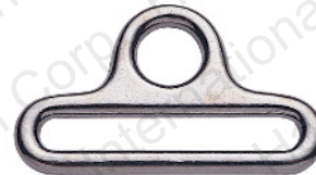
R146Z Size: 1 1/2"