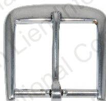
1568Z Size: 1 1/2"