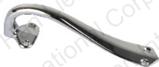
DH-168-CP Large Handle, Zinc Diecast 6 1/2" Length, Hand Polished Chrome Plated