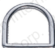
452Z Wire Dia.: 2.3, 2.5, 2.7, 3.0mm Size: 3/8", 1/2", 5/8", 3/4" Wire Dia.: 3.5, 4.0, 4.0mm Size: 3/4", 7/8", 1"