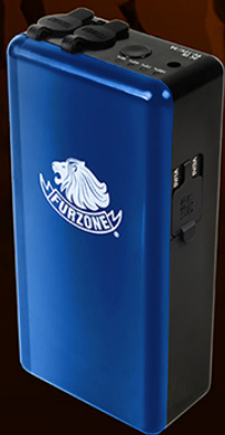
40800 Power Bank