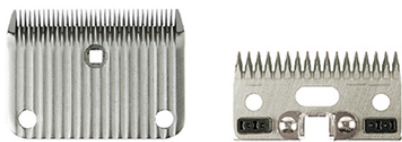
XN101 1.5mm (XL Comb) XL203 (XL Cutter)